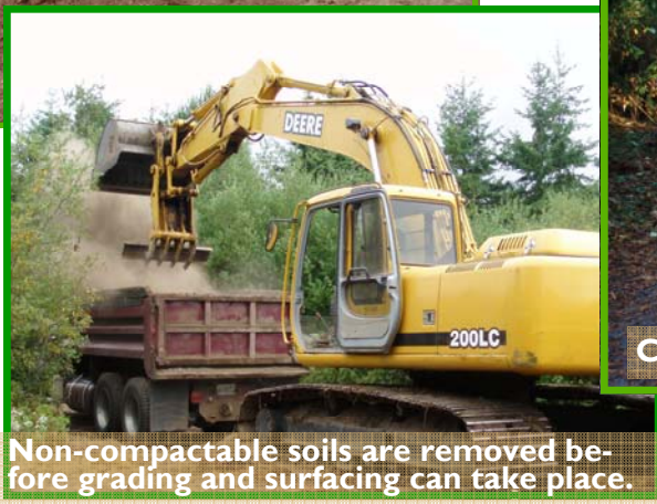
Non-compactable soils are removed before grading and surfacing can take place.