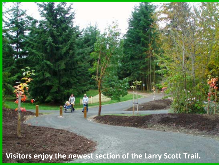
Visitors enjoy the newest section of the Larry Scott Trail.

Jefferson County Public Works has constructed the newest section of the Larry Scott Trail, adding over one mile of trail to the 4.4 trail miles already built. The new trail section extends southward along S. Edwards Rd beginning at milepost (MP) 4.0 and joins existing trail that extends from MP 4.4 to MP 4.8. From MP 4.8, newly constructed trail continues to MP 5.6. Shold Construction, Inc. of Port Hadlock cleared, graded and graveled 6,500 linear feet of new trail, constructed rock walls where required, and installed rail fencing and timber bollards. County forces completed the project with planting and signage installation.