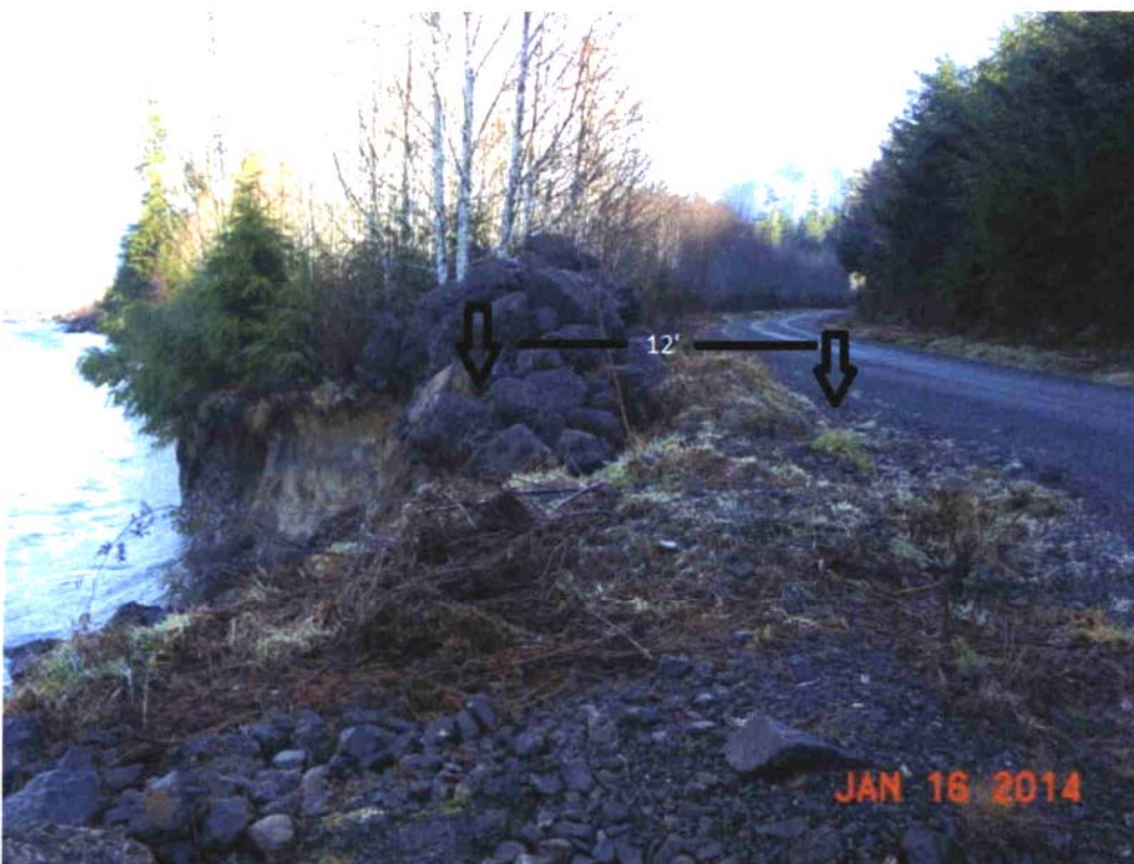
Figure 2 – Looking East, 12 feet of width remains between the bank erosion cavity and edge of roadway.