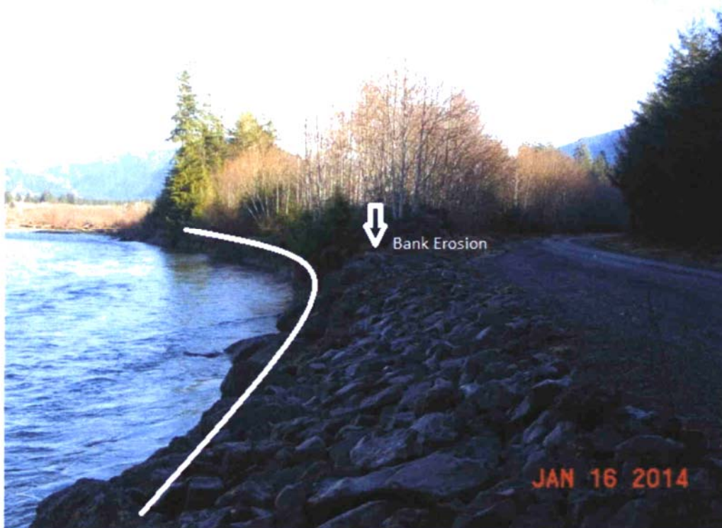
Figure 1 – Looking upstream (East), Bank Erosion cavity at head of 2010 Emergency Repair revetment.