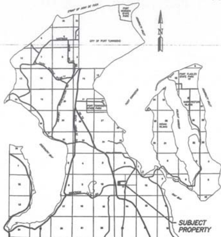
QUIMPER PENINSULA VICINITY MAP NO SCALE

A PORTION OF THE NORTHWEST 1/4 OF SECTION JEFFERSON COUNTY